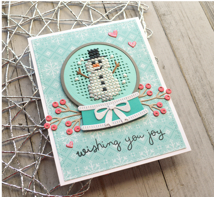
created for lawn fawn by chari moss

Pattern for Embroidery Hoop Lawn Cuts by Chari Moss